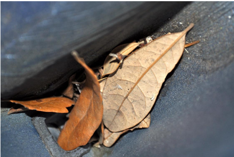
Debris around the drain