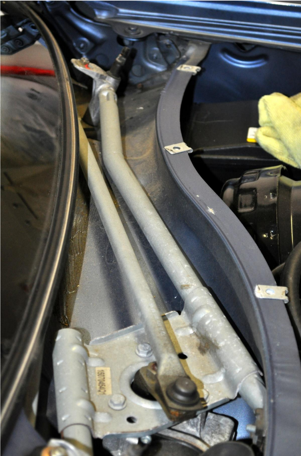
A view of the driver side beneath the cowl.